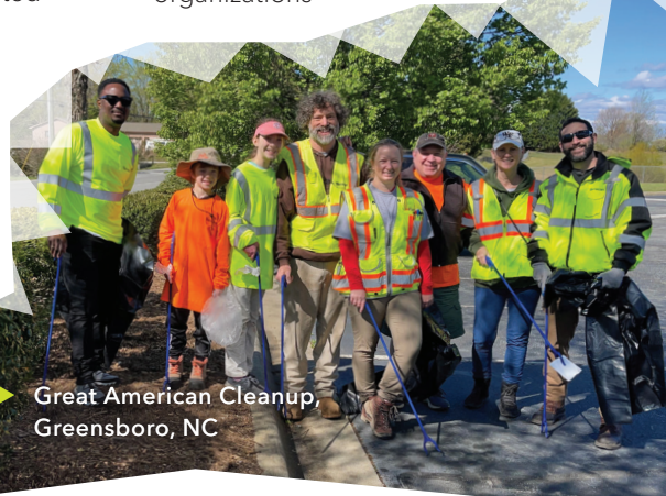
Great American Cleanup, Greensboro, NC

Sustainable and diverse supplier procurement practices implemented across our purchasing and real estate management platforms.